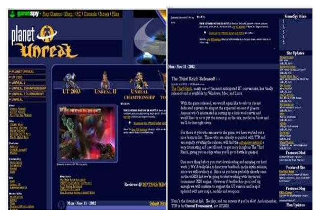
Figure 1 – Before and after of a page using DOMbased content extraction (Images from [1])

An easily implementable technique for content extraction is to alter the generated DOM (Document Object Model) tree[1]. This involves using analytical techniques to identify where relevant content is located in a page. For example, by analysing the percentage of text that is a link in a particular paragraph, it can be identified whether that paragraph contains important information. Depending on the result, the paragraph can be positioned elsewhere in the document, or removed from the DOM tree entirely. Figure 1 shows an example of a page before and after using DOMbased content extraction.